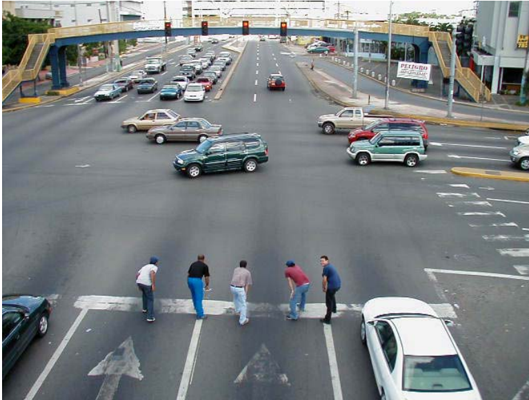
Illust. 1: Paths of conflict: the problems of car and pedestrian intertwined in the city are represented by architecture students at the starting line of everyday life in San Juan, Puerto Rico.