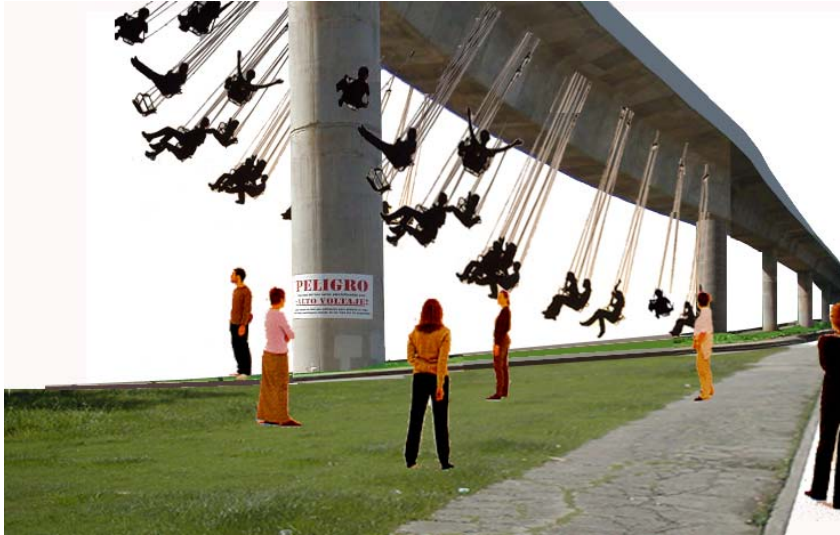
Illust. 3: Underused spaces are plentiful in San Juan; swings and complementary recreational equipment is recommended as palliative to nothingness. [student photomontage]