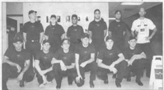
□ Estudiantes de arquitectura de la Universidad Politécnica de Puerto Rico se lanzarán hoy al rescate de los espacios peatonales de Bayamón.