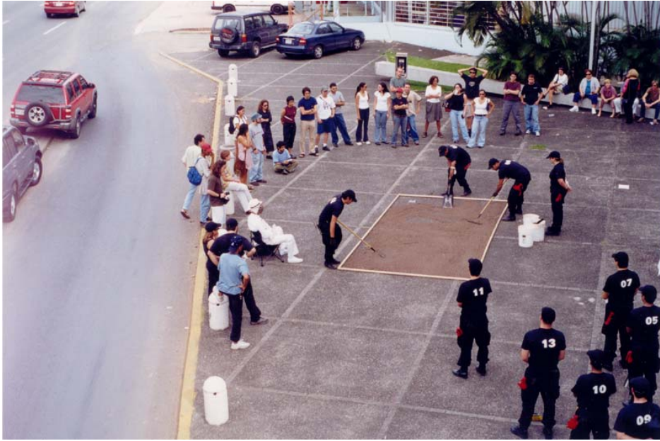
Illust. 9: public and pedestrians watched the Anarchist gardeners in action, as they marked down the space occupied by the car, in preparation for laying out a garden.