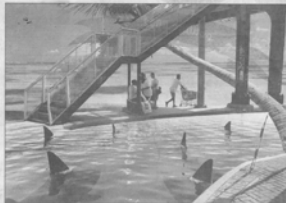
En la foto, un concepto artístico de las complicaciones que viven los peatones.

La muestra permanecerá abierta en las salas 2 & 3 del Museo de las Américas. El Museo está ubicado en el segundo piso del Antiguo Cuartel de Infantería de Bayamón, en el Viejo San Juan, en horario de martes a domingo de 10am a 6pm.