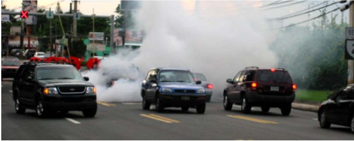
Illust. 11: Ephemeral gardens challenged traffic, while simultaneously making their presence evident within the city, in this case, with smoke.