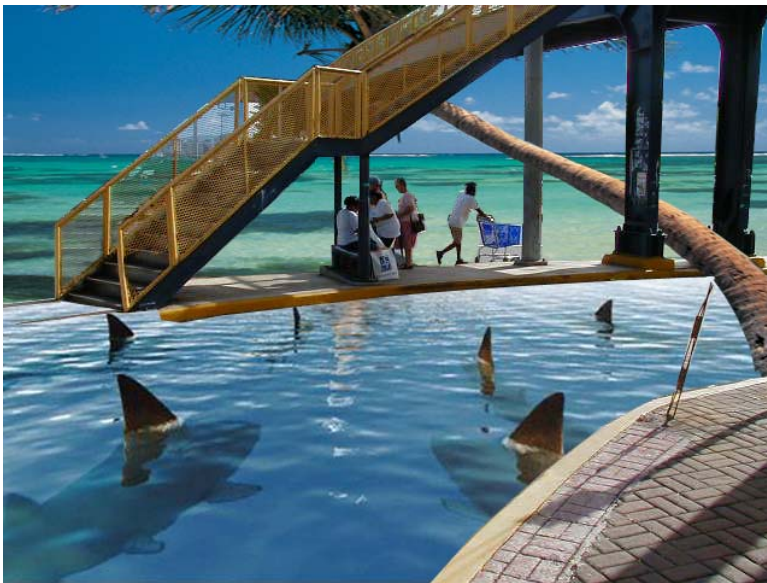
Illust. 2: The aggressive nature of the urban realm in Puerto Rico renders street and road crossings as a dangerous activity, full of deadly surprises. [student photomontage]