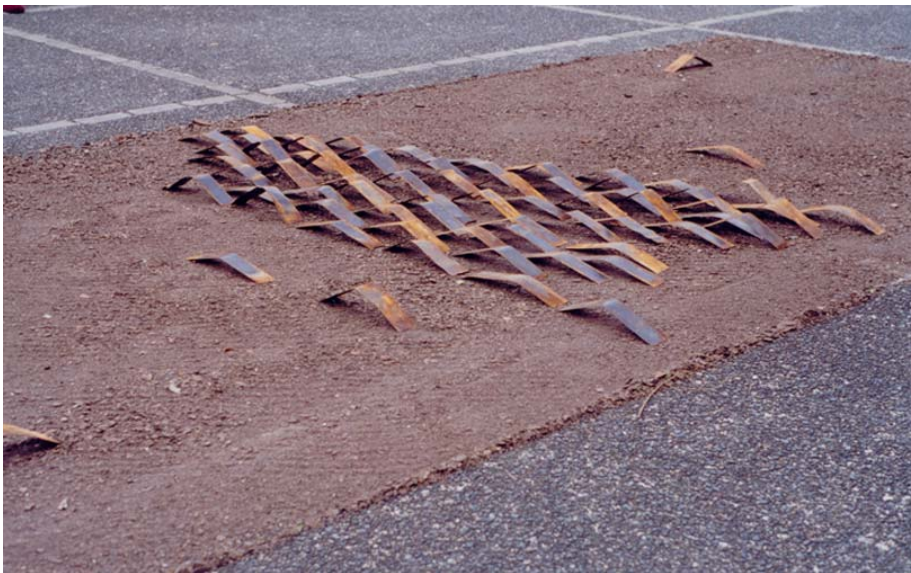
Illust. 10: One of the many finished Zen gardens, this one with rust and rusted pieces.